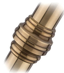
Aged Brass Un-Lacquered