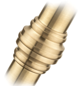
Satin Brass Waxed