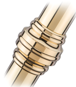
Polished Brass Un-Lacquered